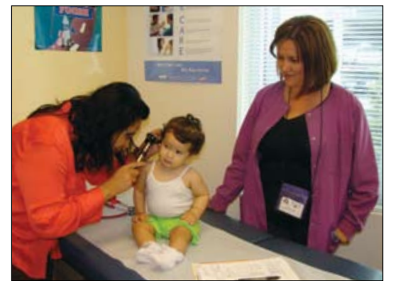
The clinic visit experience has been redesigned at Winton Wellness Center's Women's Services and Pediatric Clinic and patients love the results.

In 2008, Winton provided 29,641 visits. In 2009, the number of visits grew to 32,383, almost a 10% increase.