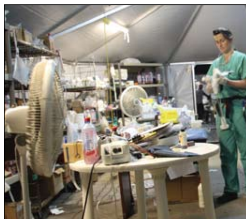
Inside the ER tent outside damaged hospital.