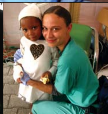
Members of the first ACMC Team to arrive in Haiti after the earthquake: