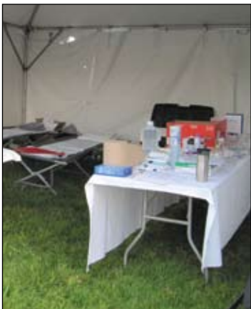
ACMC supplies and cots at a first aid station were ready to treat runners.